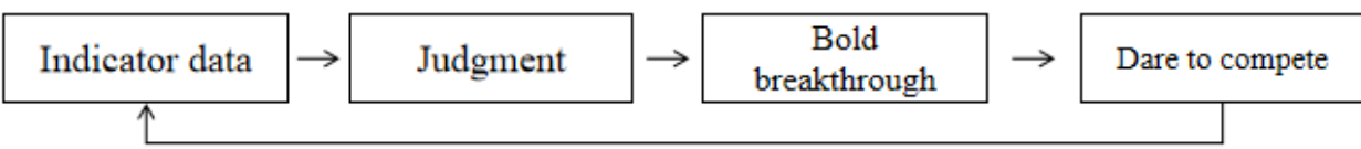
Figure 2. Application of AHP method

The concept of core competitiveness is deepened in the development of enterprise management, which can help enterprises gather more internal strength, promote enterprise development, and effectively speed up the construction process. Take advantage of it. The concept of contemporary enterprise management should first focus on the core competitiveness of the enterprise, that is, to develop the core management of the enterprise. The concept of core competitiveness has become the soul and core of contemporary enterprise management concepts. From this, we realize that it is very necessary to establish the dynamic development concept of core competitiveness. On this basis, actively carry out enterprise resource management, establish a database, speak through factual data, and make wise choices. We adopt management strategies to adjust and strengthen the disadvantages, so as to help enterprises establish more advantages in the development and competition, enhance market competitiveness, and open up more market space.